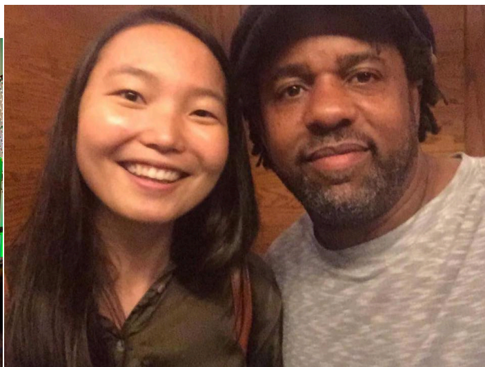
Performing with Victor Wooten in Kenya as SkyBridge